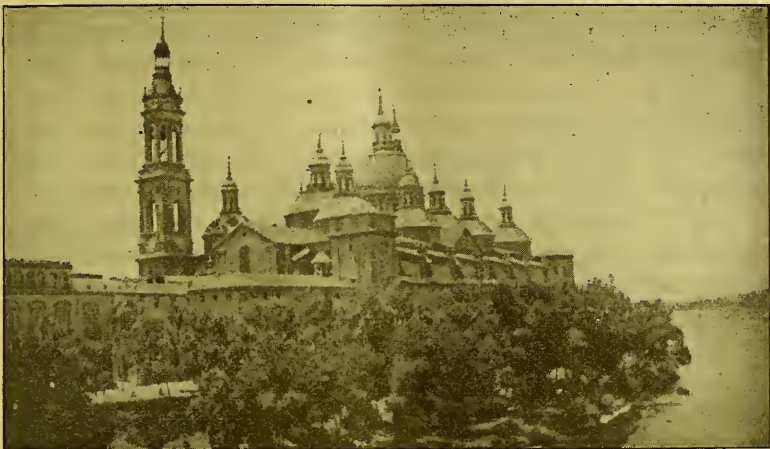
Cathedral el Pilar, Zaragoza

can simply pretend that you are doing it." Then, seeing that the boy was in earnest, he dismissed him gruffly, promising nothing. The next morning when the soldiers were marshaled in the cathedral one of them was fully determined to stand back when his turn came to kiss the pillar, even if so doing cost him a week in the guard-house. His captain, however, with an officer's objection to public scenes, caught his eye and motioned slightly toward the door. The boy was only too ready to take the hint.